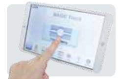
Wireless control with tablet